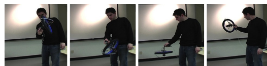
Figure 4: The Gyrotyre , by Elliot Sinyor [20].

The Gyrotyre [20] is a handheld bicycle wheel-based controller that uses a gyroscope sensor and a two-axis accelerometer to provide information about the rotation and orientation of the wheel. It was designed as a controller around a small group of mappings that would make use of the continuous motion data. We will look at two Gyrotyre mappings in order to place them in the framework.