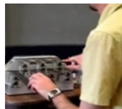
Figure 2: The Rulers , by David Birnbaum.

contact microphones and accelerometers to sense the amplitude, direction and pressure of bowing gestures, this controller allows the continuous excitation, as well as modification, of its sound. Pitch and timbral sound elements, created using scanned synthesis [19], are controlled by sensors on the controller’s neck, sensing position and pressure of touch on two channels, and also strain of the neck itself on one axis.