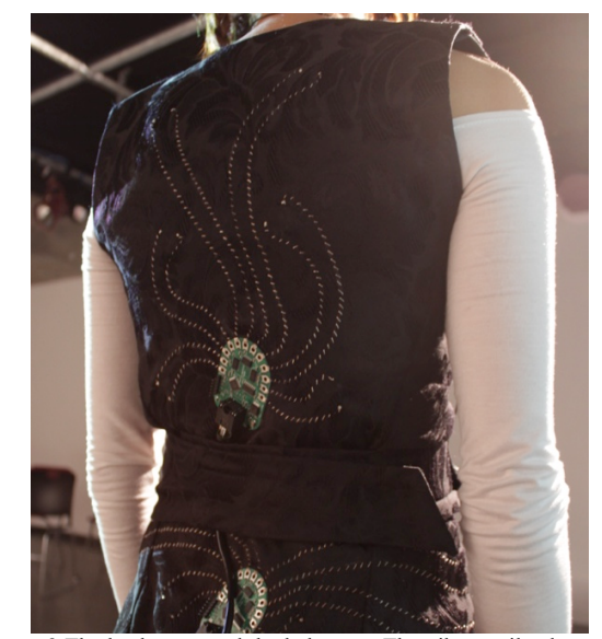
Figure 3 The back zone and the belt zone. The vibrotactile elements lie underneath the area between two connector endings emanating from each of the central boards.

From the the start, therefore, we aimed at integrating the technological elements of the suit (motherboards, vibrotactile elements, cables etc.) into the textile design – for example, all vibrotactile elements were sewn into the suit, connections inside the suit were stitched – and look like embroidery.