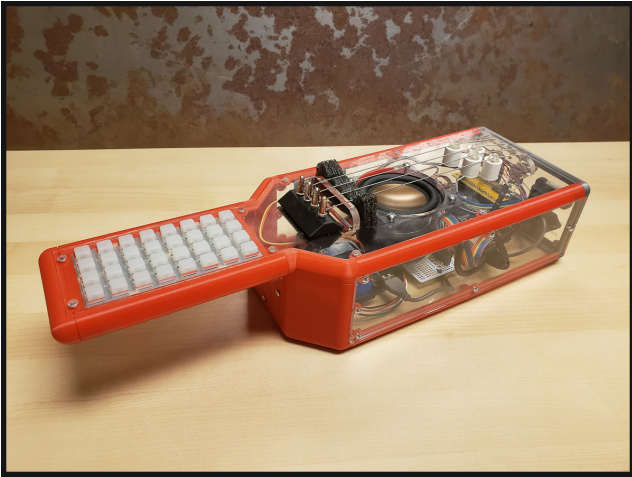
Figure 4: The Stringbox.

While the Keybox is finished and playable at present, we continue to make incremental enhancements. In its current form it lacks direct sound output, but an updated version of the enclosure will include onboard amplification, which is a feature of the other instruments. Additionally, we have installed an IMU that will map movement of the instrument to user-selectable sound parameters.