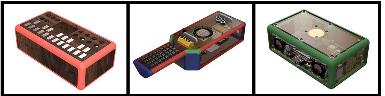
Figure 2: CAD renderings of three new Noiseboxes (L-R): the Keybox, Stringbox, and Tapbox.

The Keybox utilizes the same computing hardware as its predecessor, utilizing a Raspberry Pi 3 Model B+ for audio processing and general system function, and a Teensy 3.2 microcontroller for sensor acquisition. However the software framework has been redesigned from the ground up. Sensor data is encoded into bytes on the Teensy using the Consistent Overhead Byte Stuffing (COBS) protocol. This facilitates the efficient and reliable transfer of data with minimal latency [4], which has shown substantial improvement over previous versions. On the Raspberry Pi, all audio