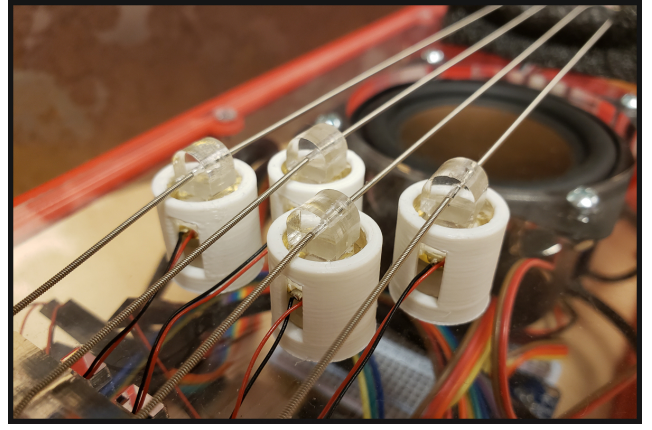
Figure 5: Detail of the Stringbox piezoelectric pickup assemblies.

Alternately, a separate mode can fully reconfigure the instrument, and while the physical and visual similarities may remain, it becomes totally different. In this mode, the 4x8 grid can function as a sequencer, with different pages to determine sound sources and synthesis algorithms, sequences and arpeggios, while the strings can be manipulated by the user to modulate the corresponding audio track.