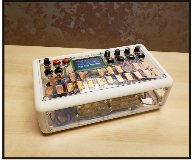
Figure 3: The Keybox.

audio input. It is equipped with an onboard OLED display, four multifunction rotary encoders, 8 buttons and a 20-note piano-style capacitive touch keyboard. Whereas the previous Noiseboxes were best at producing dense swarming chaotic drones, the Keybox is immediately easy to play, control and understand, while the multifunction encoders, buttons and display provide access to a host of parameters for deep modulation and sound design.