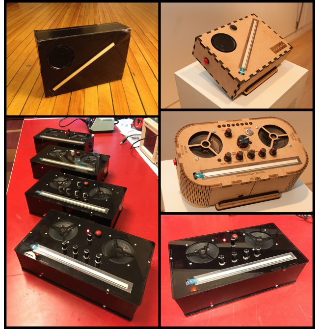
Figure 1: The Noiseboxes, v1 & v2 (Clockwise from top left): v1 initial prototype, v1 finished, v1 with additional controls and audio FX, v2 with additional controls and FX, a quartet of v2 instruments.

instruments and develop personalized playing styles. Following the basic format of a previous study by [18], four participants were given an instrument to take home for one month. After two weeks they returned individually to report on their progress and give a short demonstration performance with the instruments. At the end of the month they returned as a group to give another performance, this time with a small invited audience in attendance. Feedback was collected from the participants and audience members through interviews, questionnaires and a round table discussions.