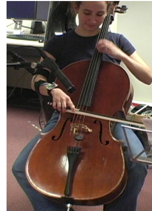
Figure 2: The accelerometer-based capture system in use. The accelerometer board is being worn on the performer's bowing arm.

connected to the computer using a Teabox sensor interface from Electrotap 2 , which recorded the accelerometer data at a sampling rate of 1 kHz and a resolution of 16 bits. This provided high-quality data for our analysis.