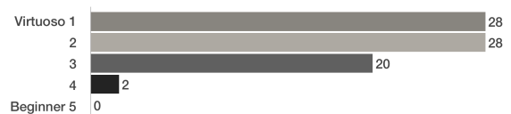
Figure 2: Answers to the question: How would you consider your level of proficiency with the instrument? 1: Virtuoso - 5: Beginner

A section of the questionnaire enquired about the development of virtuosity with NIMEs. We asked to indicate on a 5-point likert scale their level of virtuosity with their instrument. The result, shown in Figure 2, indicates that most performers are confident considering themselves virtuosos with the instrument. Surprisingly, 22 performers (28%) self-reported their level of virtuosity with an instrument that play or have played in public as 3 or 4 (1: virtuoso ; 5: beginner ). Answers to another question partially contradict this result: when asked to indicate the number of musicians that can be considered virtuoso with the instrument, 76% (N=60) answered that no virtuosos exist (so far).